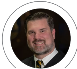
Hon. Paul F. Kraus 20th Circuit Court