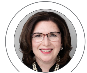
Hon. Laurie N. Savin 6th Circuit Court