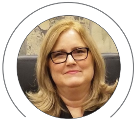
Hon. Debra L. McNabb 17th Circuit Court