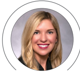
Hon. Brittany Dicken 10th Circuit Court