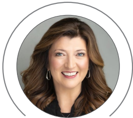
Hon. Maureen H. Kinsella 6th Circuit Court