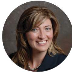
Hon. Maureen H. Kinsella 6th Circuit Court