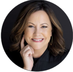
Hon. Megan K. Cavanagh Michigan Supreme Court