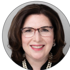
Hon. Lorie N. Savin 6th Circuit Court