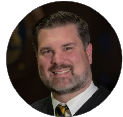
Hon. Paul F. Kraus 20th Circuit Court