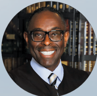
Hon. Gregory C. Pittman Muskegon County Probate Court