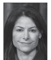
Dana M. Nessel Michigan Department of Attorney General, Lansing

Presented by The Marijuana Law Section of the State Bar of Michigan