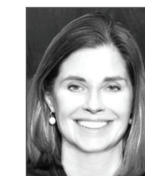
Hon. Bridget M. McCormack Michigan Supreme Court, Lansing