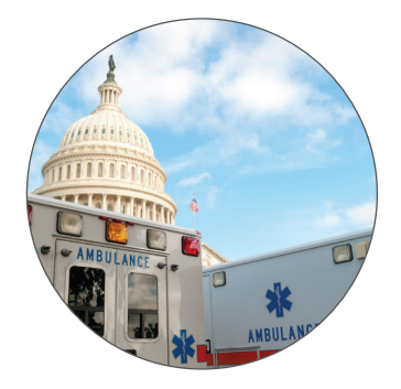
Health Care Reform See page 5