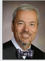
Hon. Ronald L. Buch United States Tax Court, Washington, DC