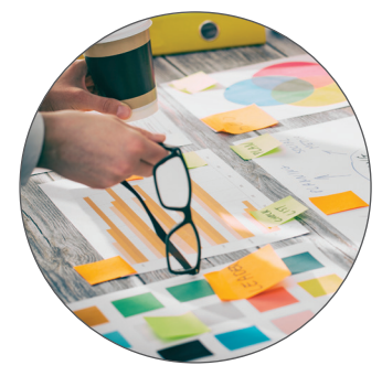
Innovative Payment Models See page 6