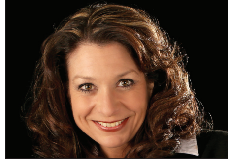
Moderator Friday Plenary, Evidence Track

Chair, Family Law Section of the State Bar of Michigan, Third Judicial Circuit of Michigan—Family Domestic Court, Detroit