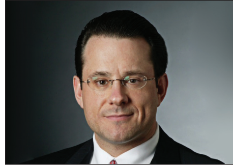
Moderator Financial Track