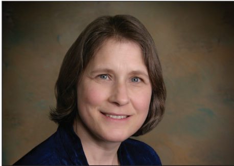
Moderator Client Advocacy Track